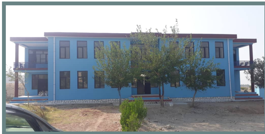
New school in Achin