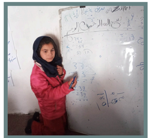
Badakhshan Shaghnan girls classroom